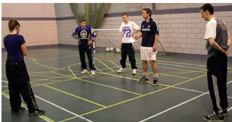
▲ Sporting Chance teaches skills in sports leadership

Recruitment is underway for the next delivery of the Volunteer Centre's popular Sporting Chance training programme.